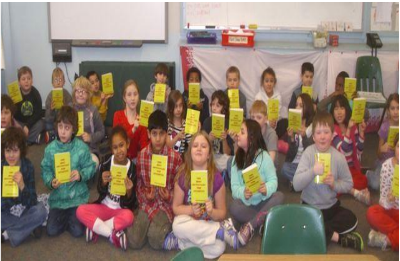
ABOVE: The Greenfield Lodge of Elks #1296 delivered 50 Dictionary's to the Greenfield third grade classes and talked about the Dictionary Project and about the Elk's part in this very special project. As you can see the kids are happy to have their own special Dictionary.